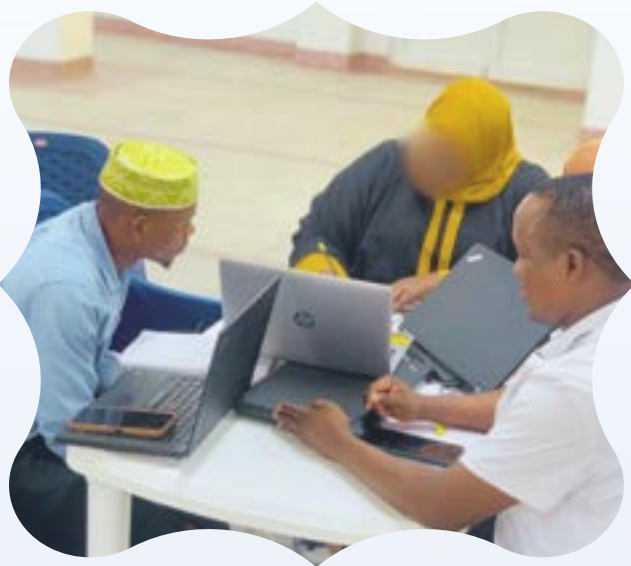
Department of Language