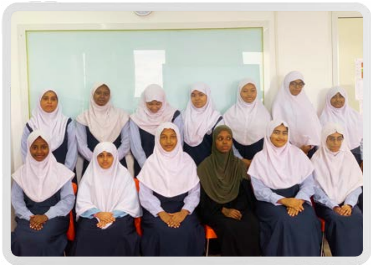
STAGE 10 G

Students with their teachers, class by class.