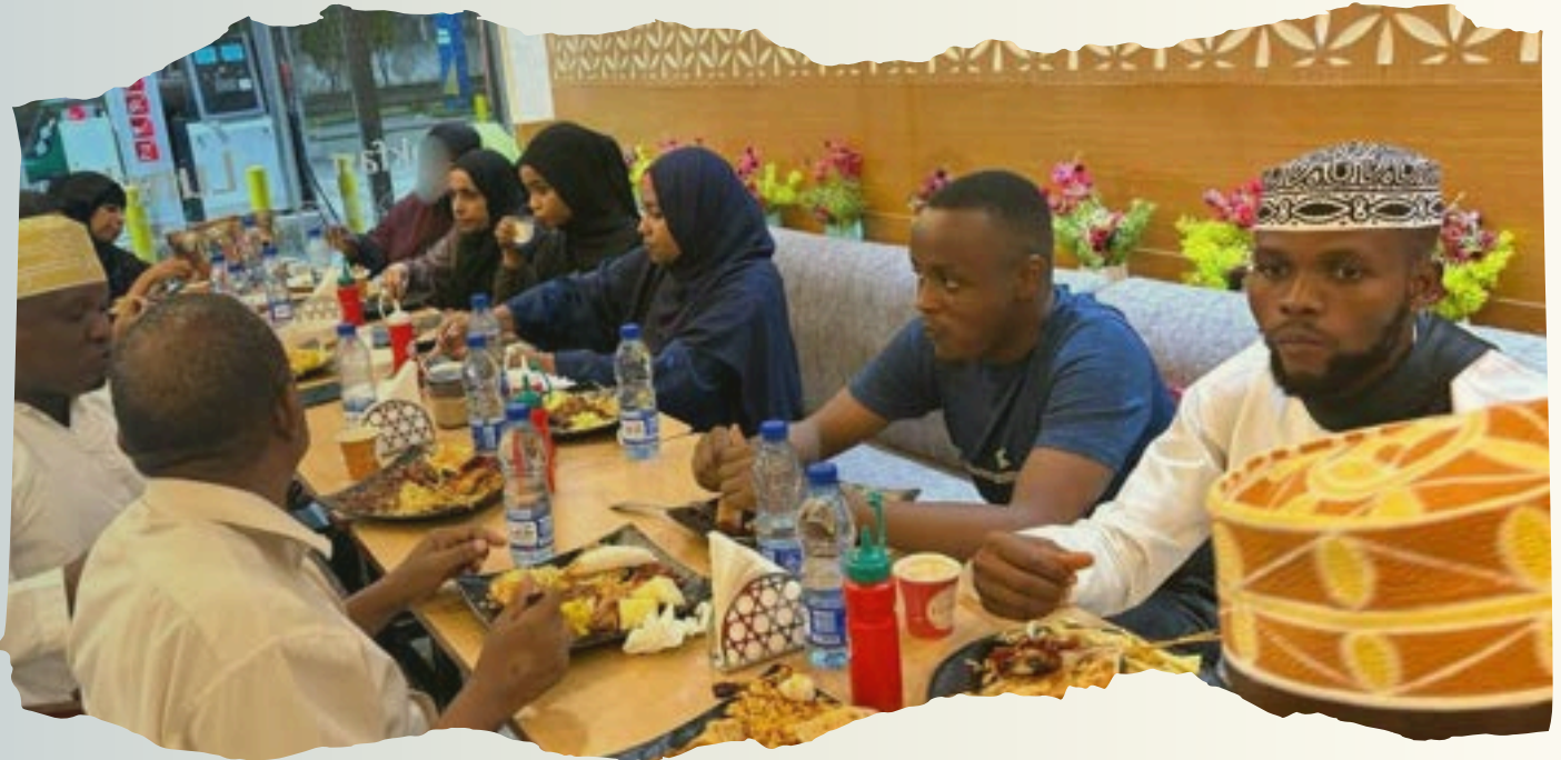
"Teachers and school staff gathered to share Iftaar during the holy month of Ramadhan, celebrating unity and togetherness."