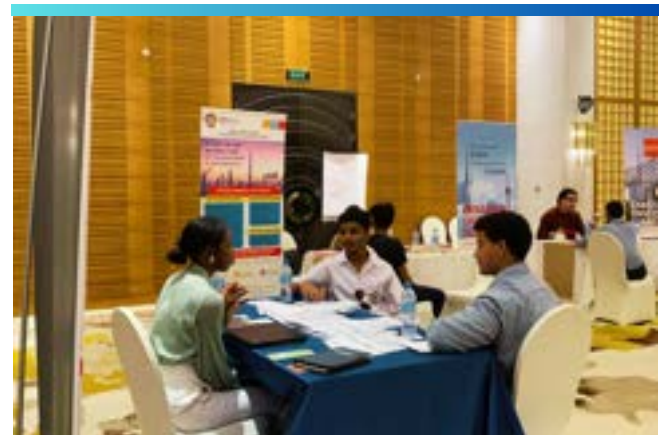
“Students engage with university agents on future studies.”