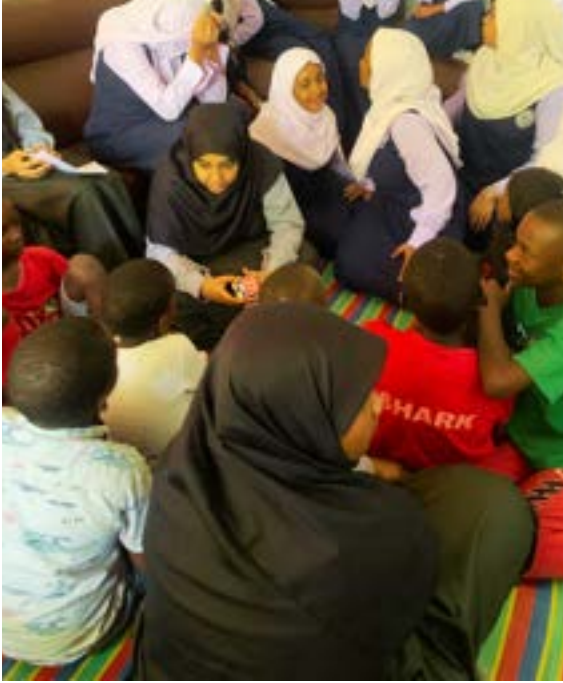
“Luminous students sharing joy at Umra Orphanage.”

Students visited Umra Orphanage, where they engaged in mural painting, storytelling, and games spreading joy and building meaningful bonds. This touching experience reflected the Quranic teaching: