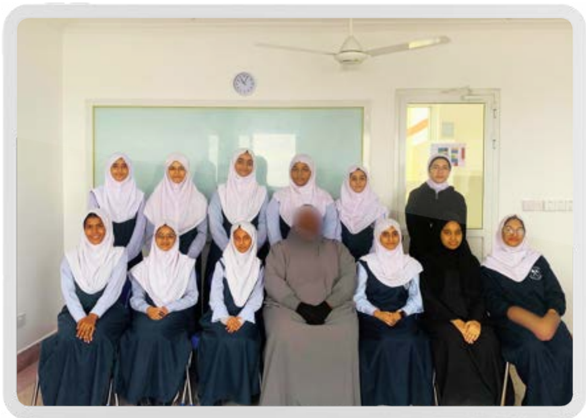
STAGE 11 G