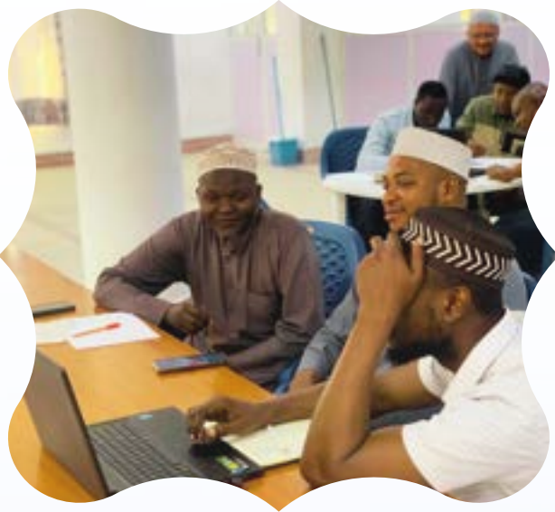
Department of Religion