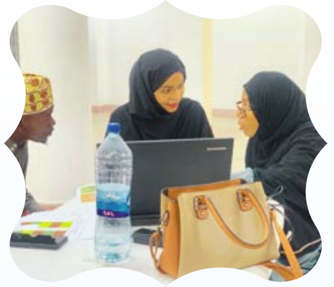
Department of Mathematics