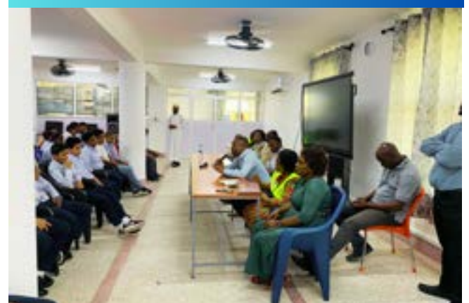
“Local officials inspire students on health awareness.”

They also explored future opportunities through a university fair on campus, where university representatives provided guidance and answered questions. A visit to Johari Rotana offered a glimpse into campus life. Additionally, local government officials conducted sessions on health, leadership, and community service encouraging students to make informed, responsible choices.