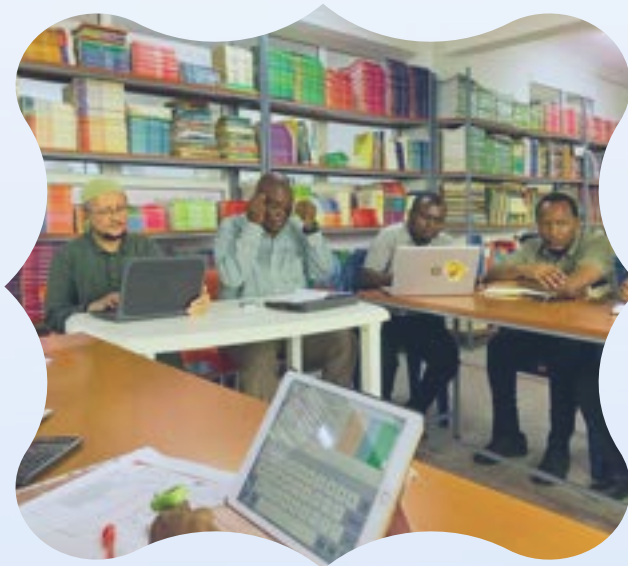
Department of Science