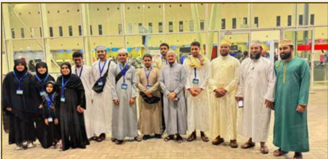
"Walking in the footsteps of history our students' journey to Makkah, Madinah, and Taif was a powerful reminder of the beauty of faith and togetherness."