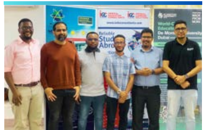
“University representatives at Luminous.”