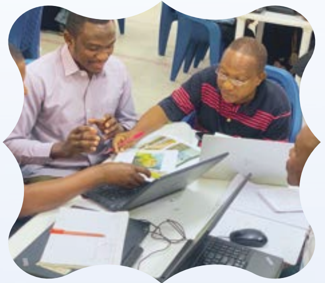
Department of Business