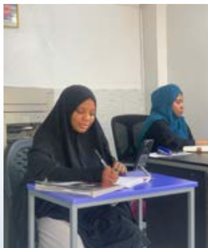
Accountant (left) and Admission Officer ( Right)